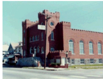
(top)A sketch of the "Temple Church," 7th and Parallel, as it appeared in 1909. (bottom)A picture of the Olivet Institutional Baptist Church, 7th and Parallel, as it appears today, with a change in the front steps.