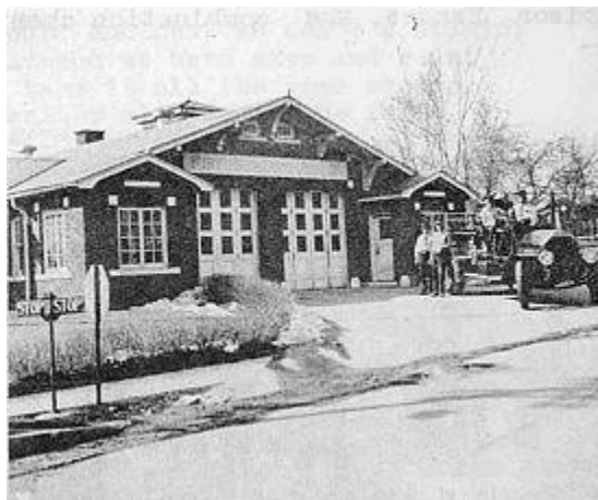
Kansas City, Kansas Fire Station No. 12

One of the provisions of Annexation was that a Fire Station would be built "on top of the hill."