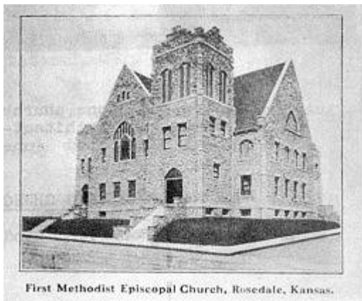
First Methodist Episcopal Church, Rosedale, Kansas.

After annexation, the churches that had the word "First" in their title became "Rosedale." (Now: Rosedale-United Methodist Church.)