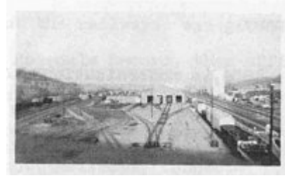
View - Frisco Yards