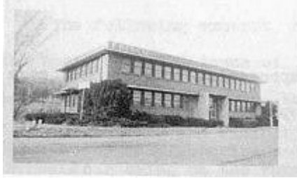
Frisco Office Building

The Leavenworth, Lawrence and Galveston R.R.