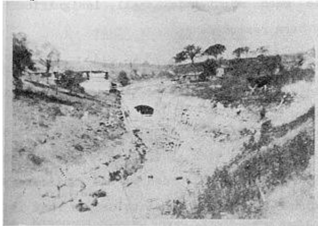
Another View Showing the Tunnel Under Construction and the Dam on the Creek

The Diversion Tunnel has well served its purpose in preventing floods beyond the "Lower Section" and some valuable land has been reclaimed.