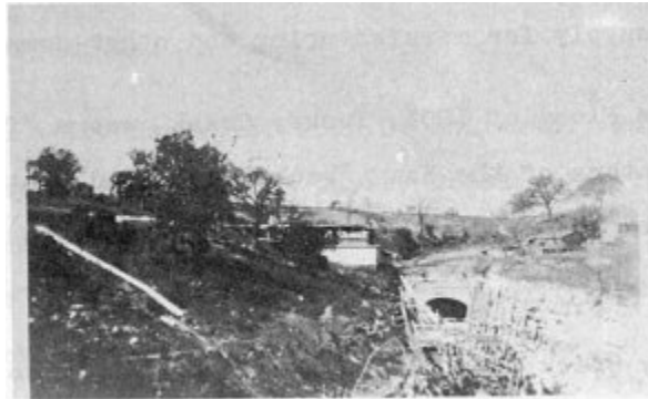
View of Turkey Creek Diversion Tunnel Under Construction - 1919

diversion tunnel thru Greystone Heights Hill. The "Upper Section" was the straightening of the creek in Rosedale and a new bridge across Southwest Boulevard.