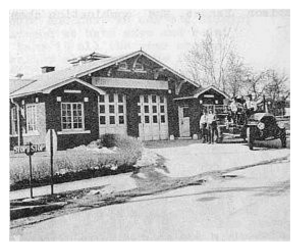
Kansas City, Kansas Fire Station No. 12

One of the provisions of Annexation was that a Fire Station would be built "on top of the hill."