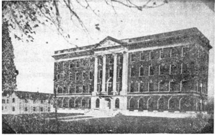
The Bell Memorial Hospital and The Kansas Medical School

May 1920, The Kerns Property (approximately 13 acres) - 39th Street and Rainbow Boulevard was purchased for $65,000 for the new hospital to be known as "The Bell Memorial Hospital and The Kansas Medical School."