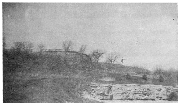
View of Retaining Wall from Rainbow Boulevard